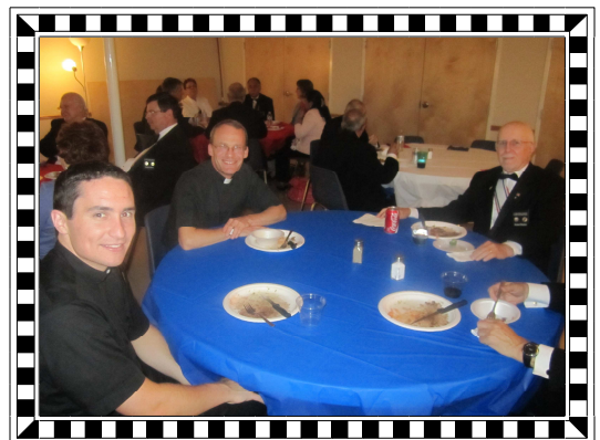
Assembly Steak Night 2011