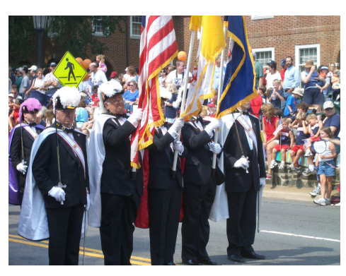
PRESENTATION OF COLORS