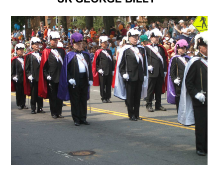
COLOR CORP READY TO MARCH