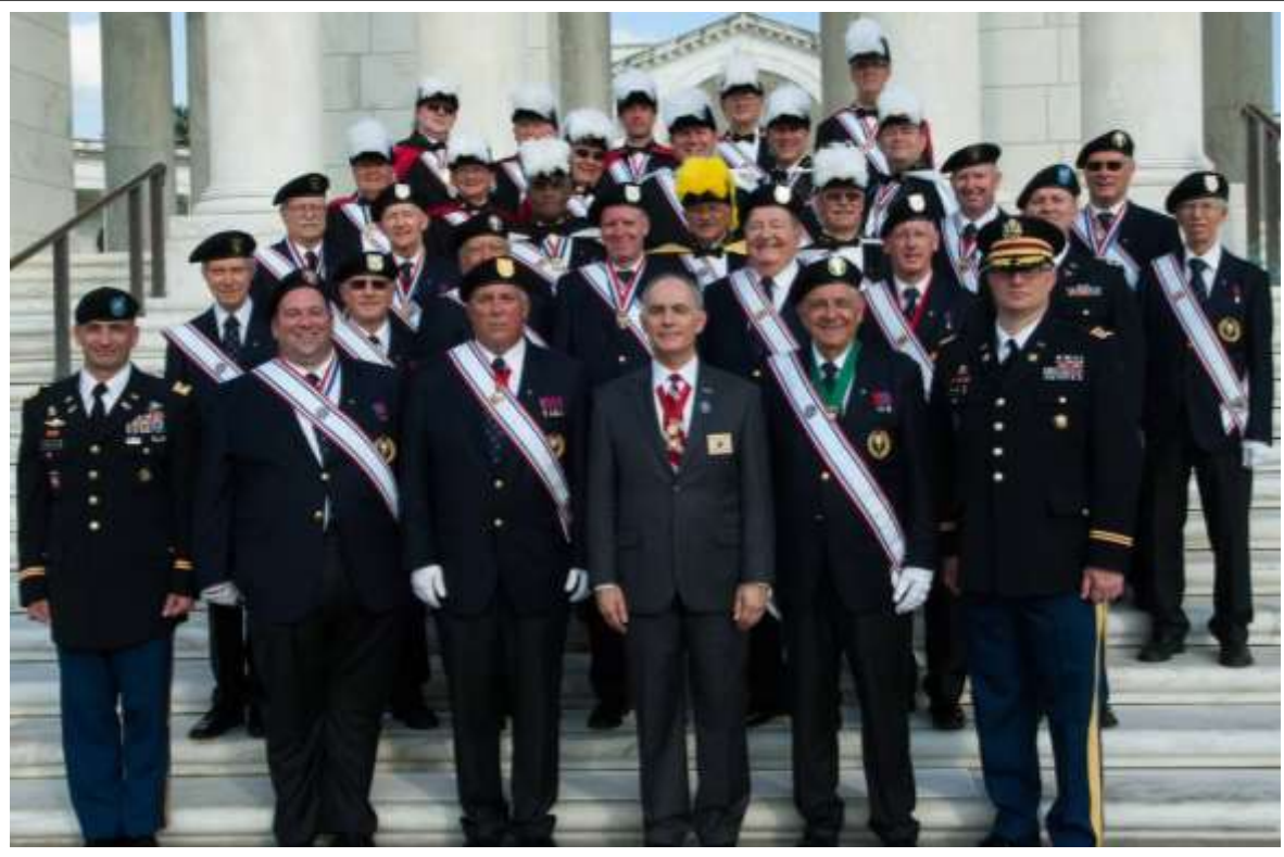
Participants in Wreath Laying Ceremony

Participants in the Wreath Laying Ceremony, held Columbus Day, Monday, October 9, 2018, included: