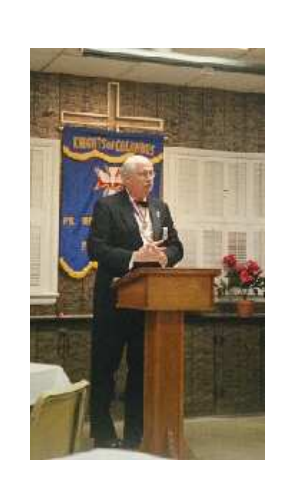
OF ASSEMBLY OFFICERS AUGUST 17TH, 2005